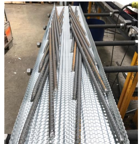
FERBOX units showing folded pull-out bars within offset casing.